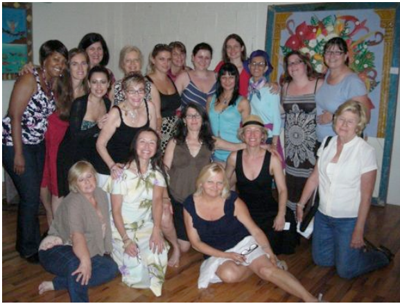
Feminine Mystique – New York