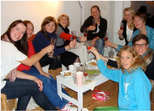
Geisha Evening Hamburg