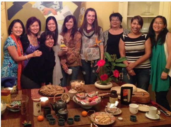
Geisha Brunch Austin

If you are the kind of woman that intends to earn well in business, this is the training you need. We are offering this pilot course one time only at a 50% price reduction. See you on Ibiza.